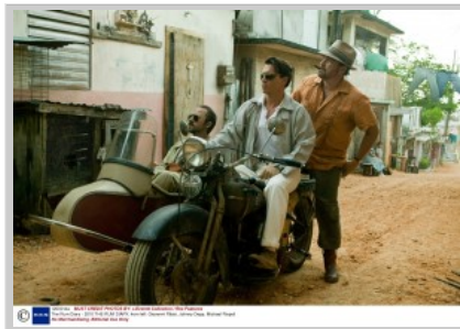
The Rum Diary