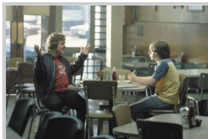
Almost Famous

We say: For all her supposed investigative skills, Lois fails to see through Clark Kent's elaborate disguise – a pair of spectacles.