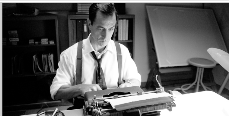
Good Night and Good Luck

Hollywood needs journalists. As well as writing the reviews that end up on publicity posters, hacks give the movies some of their favourite tropes. Where would the disaster film be without the sombre news anchor to fill in the plot, or the biopic without the pack of nosy reporters, notebooks waving and flashbulbs popping?