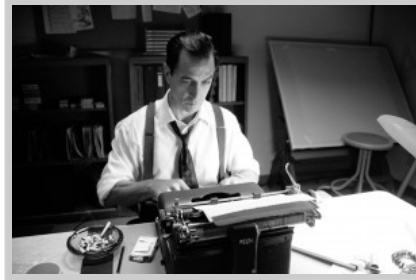
Good Night and Good Luck image courtesy of the Guardian

We say: Faced with today's media-trained stars, Bangs's advice is tougher than ever to follow.