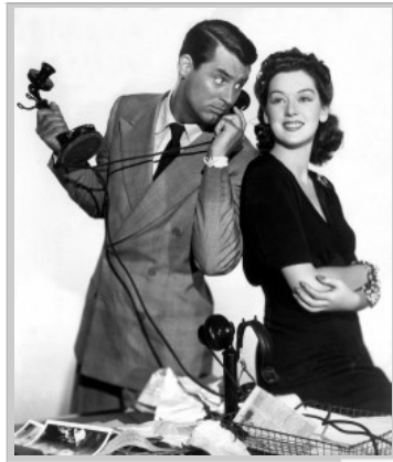
His Girl Friday

XCity takes a look at 10 journalistic "types" – the way Hollywood imagines them.